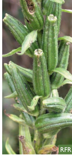
Oenothera glazioviana fruit (right)