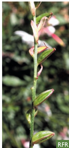
Oenothera lindheimeri developing fruit (right)

leafy stems. Rosette leaves (13–30 cm long) are narrowly oblong to lance-shaped with widely spaced serrations. Flowers (6–10 cm across) are bright yellow becoming reddish with age, in dense spike-like inflorescence. Capsule (2–3 cm long) is elongated egg-shaped and hairy, broadest near the base. [All states except NT]